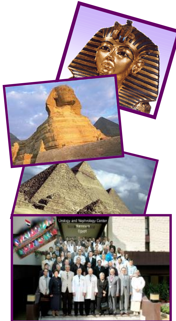
Urology and Nephrology Center. Mansoura, Egypt

Email: hassan_abolenein@hotmail.com hassan@mans.edu.eg hebazaher00@hotmail.com Fax: +20502263717 Tel: +20502262222 Website: www.unc.edu.eg